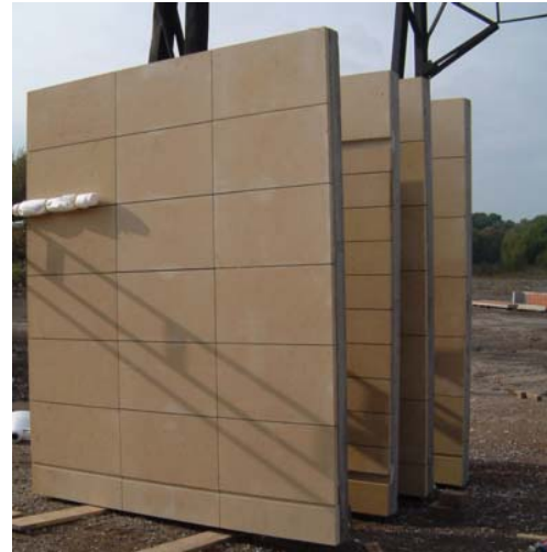
This is some text