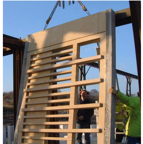
This is some text