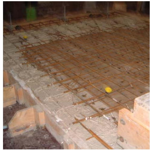
This is some text