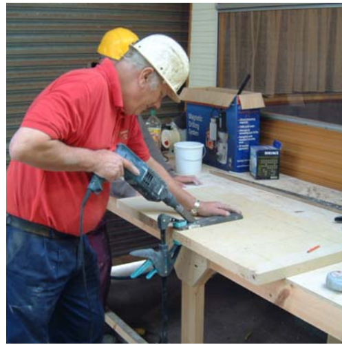
This is some text